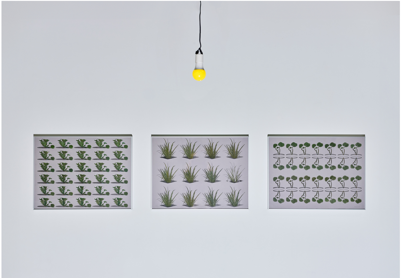
Installation view of Sewage (Jacinto de agua), Lagoons (unknown) and Shallow Waters (Hydrocotyle ranunculoides)

Automated ink drawing and watercolour on paper 2023