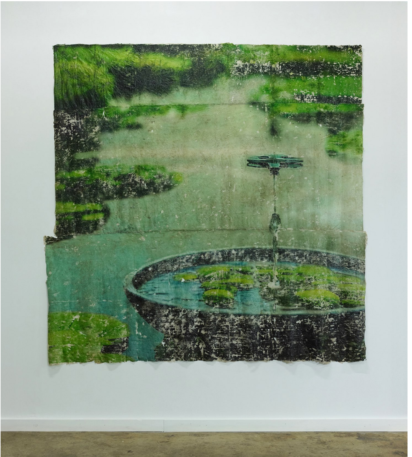
Installation view of NPC (Non-player character) Acrylate resin, ink, acrylic binder and acrylic paint 2023