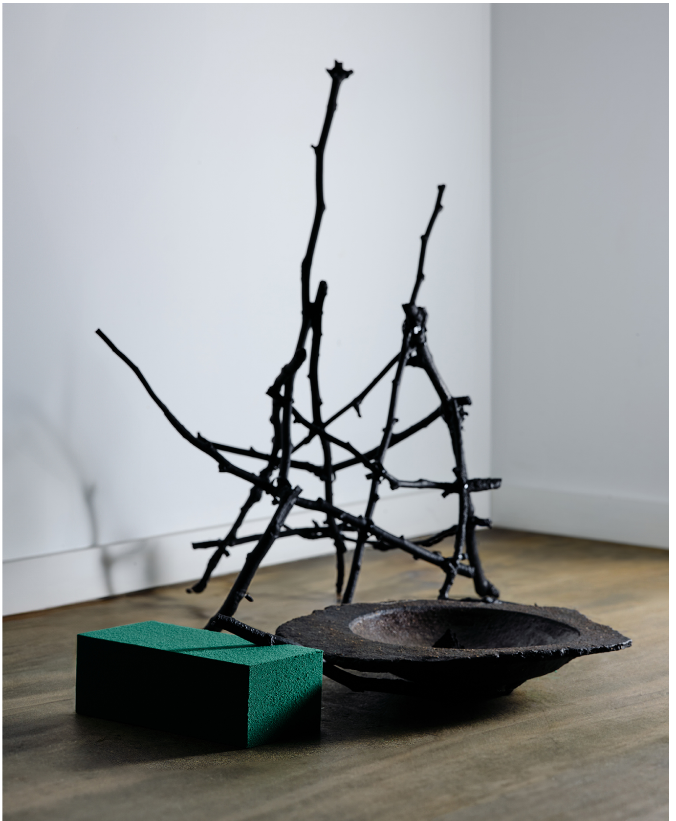
Installation view of Garden Arrangement #1 Phenolic resin, ceramics, sticks, acrylic paint and oxide 2024