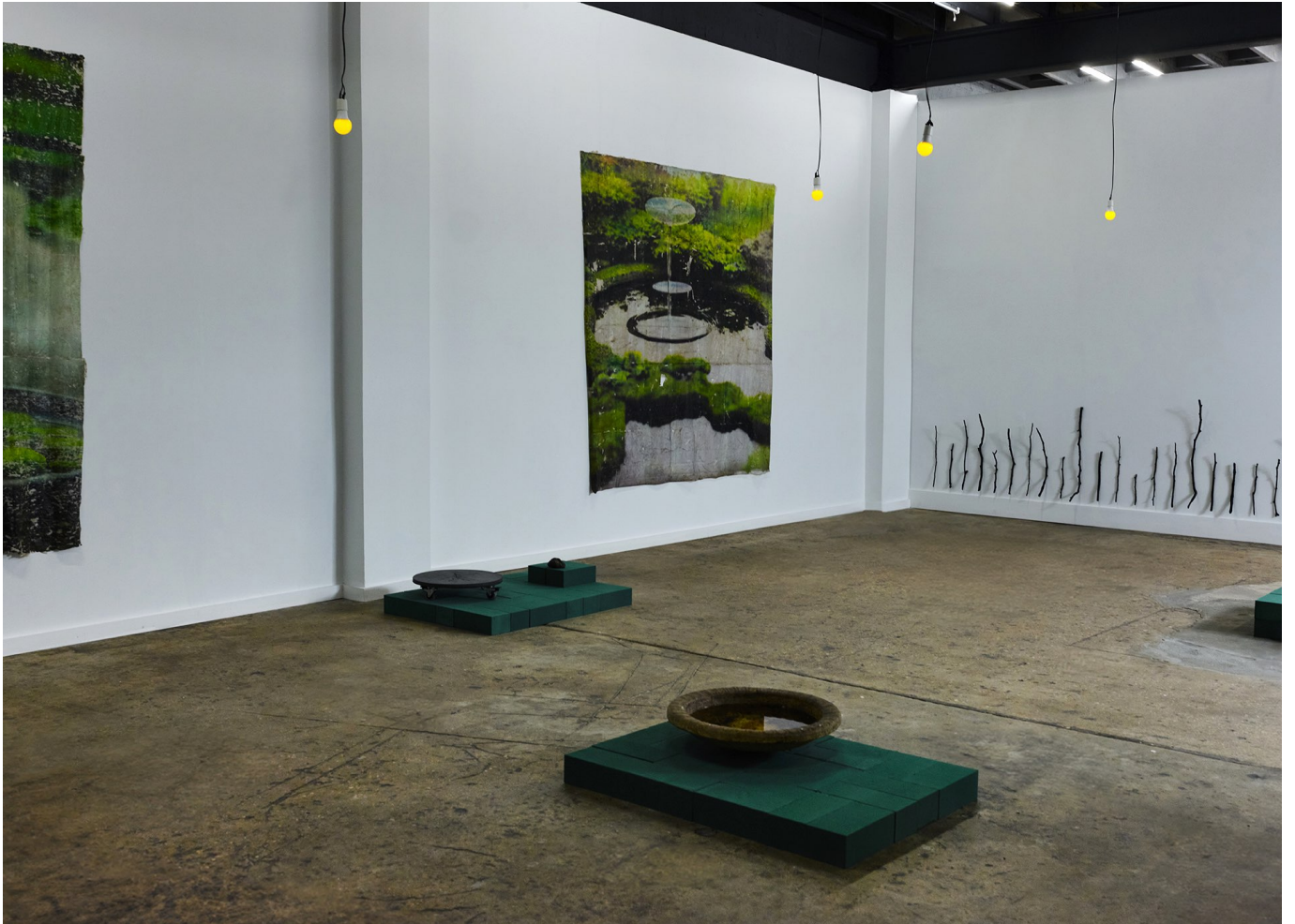
Samuel Domínguez (b. 1995) Installation view of What Happened After I Left 2024