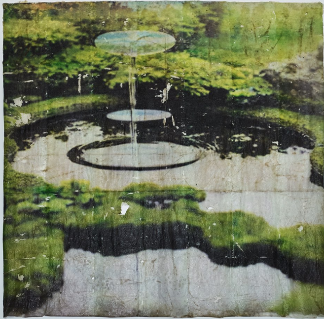
Installation view of Here, There and Now Acrylate resin, ink, acrylic binder and acrylic paint 2024